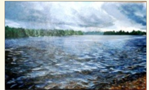
Douglas Rutzen - North Woods Elements